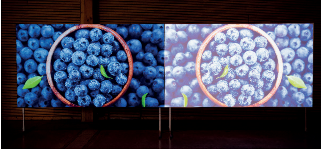
SCREEN NOIR 100