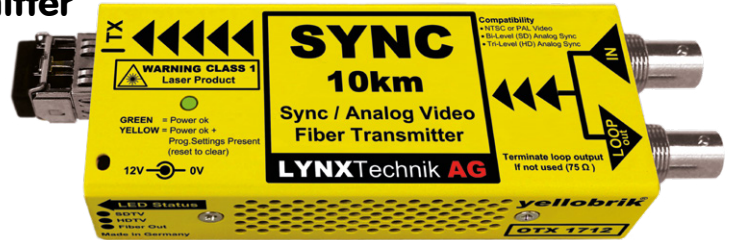
OTX 1712-2 LC Version Shown

The OTX 1712-2 provides a passive loop output and support for LC, ST or SC singlemode fiber connections. An LC version suitable for multimode fiber is also available.