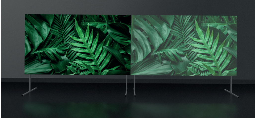
SCREEN NOIR 50